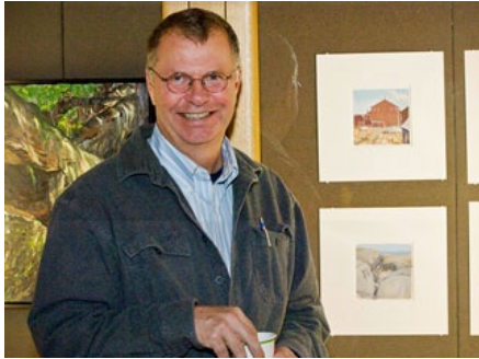
Faculty, Visiting Lecturers, Instructional Aides